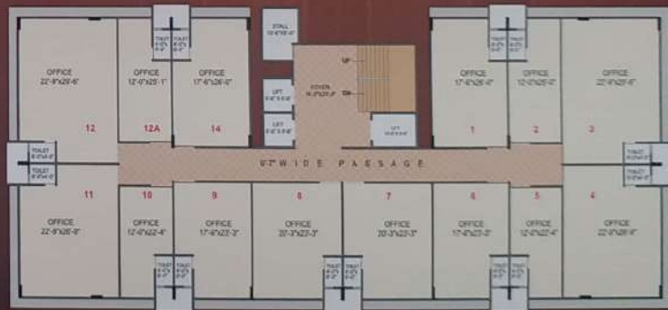
TYPICAL FLOOR PLAN (1st to 6th)