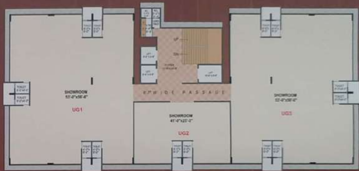
UPPER GROUND FLOOR PLAN