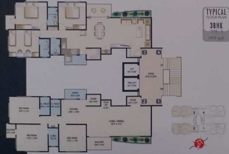
TYPICAL FLOOR PLAN 3BHK 1019 sq.ft.