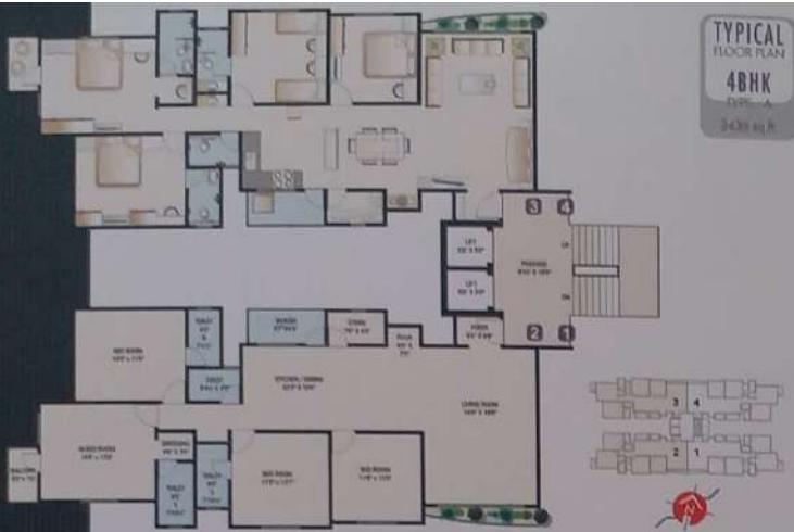
TYPICAL FLOOR PLAN 4BHK 1335 sq.ft.